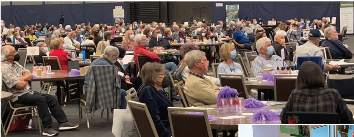
PANC Annual Conference 2022 crowd.

A big thank you to each and every one of you for helping us make the 2022 Annual Conference an amazing success!