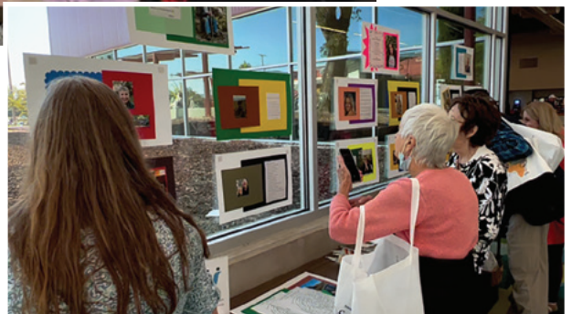
Conference attendees enjoying the I AM together WE ARE wall.